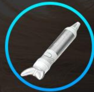
Mico Current (V Face)