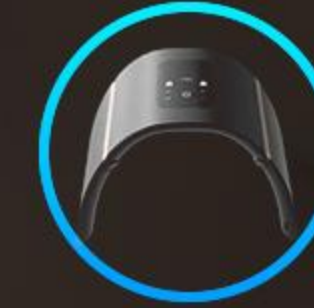
Color Light Masks