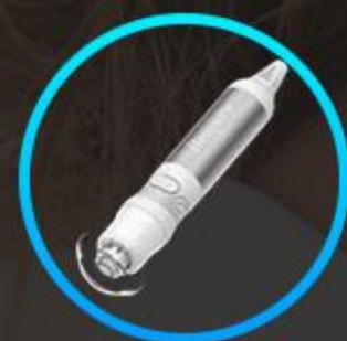
Oxygen Revitalizing Bubble