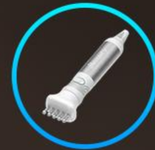
Five Poles Colorful Light Micro-electronics