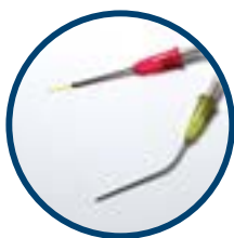
INTERCHANGEABLE FIBRE TIPS